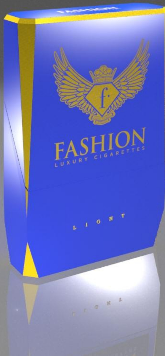
Lights (Colour Option)