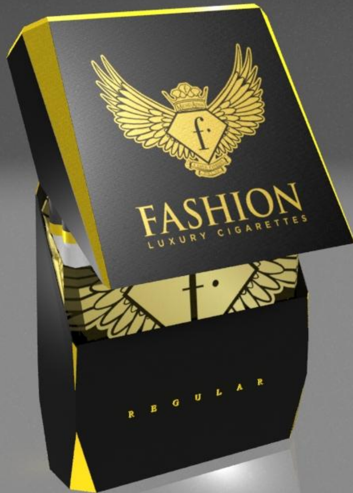
Regular - Flip Top