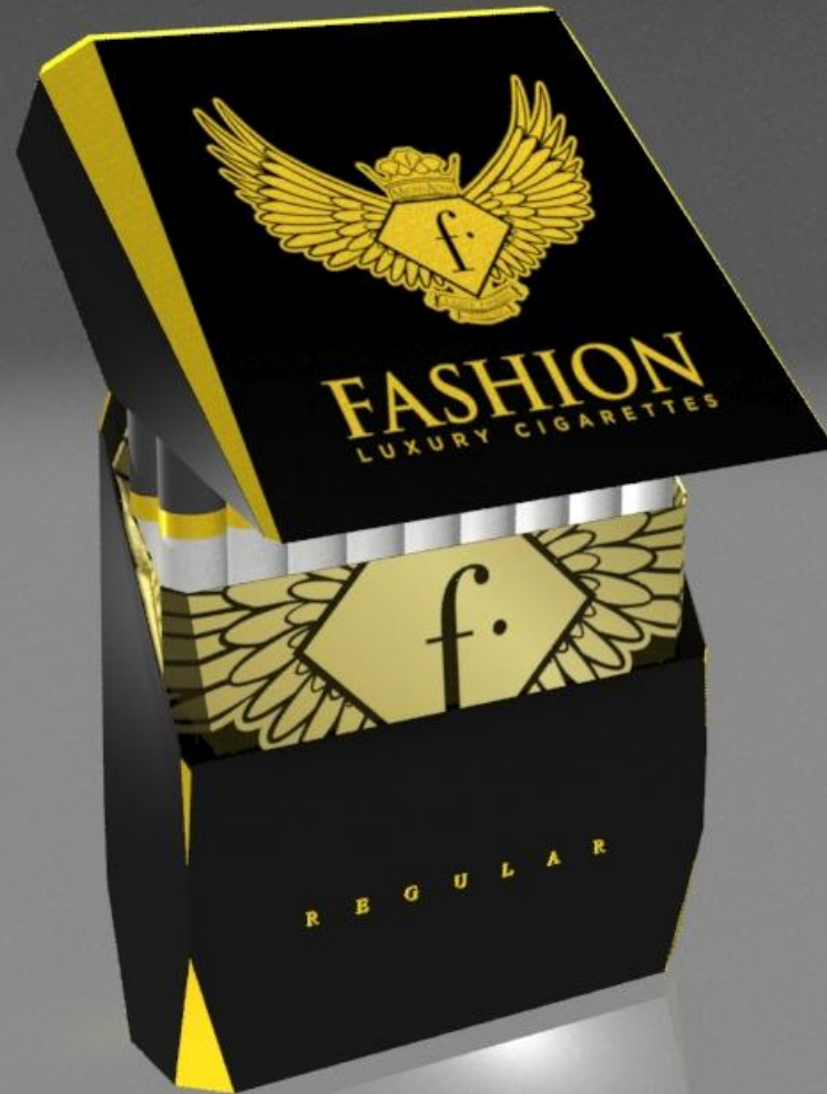
Regular- Printed foil